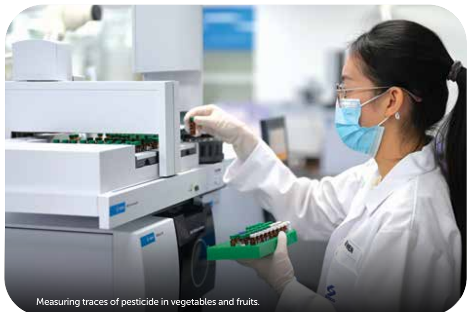
Measuring traces of pesticide in vegetables and fruits.

We achieved accreditation for drug residue analysis in January 2024, which enables us to conduct tests for 15 classes of drugs, covering a total of 80 compounds. This accreditation extends