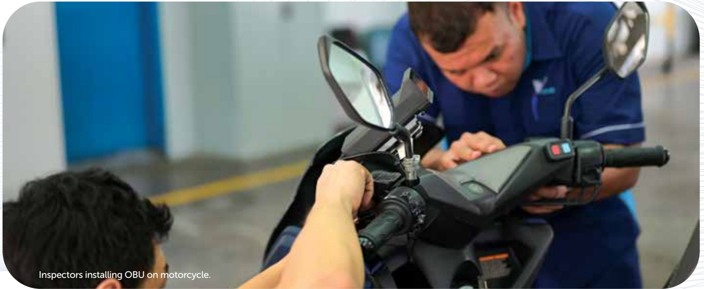
Inspectors installing OBU on motorcycle.