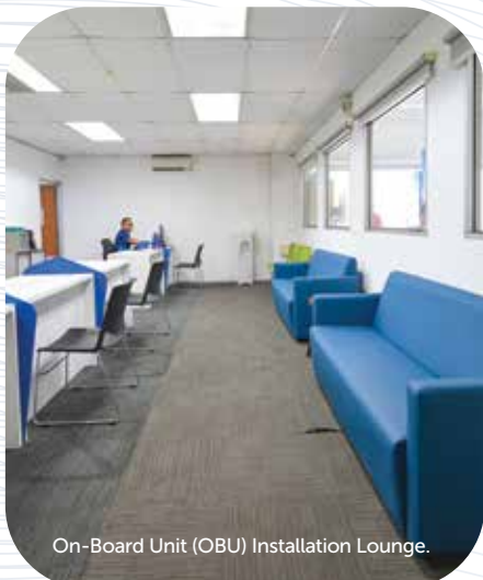
On-Board Unit (OBU) Installation Lounge.

The test laboratory was finally re-opened on 17 March 2023 as scheduled and it was accredited by the assessment team from the Singapore Accreditation Council (SAC) to conduct WLTP tests as well as the World Motorcycle Test Cycle (WMTC). The WMTC is an added feature